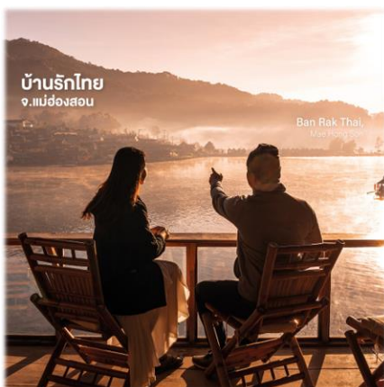
Ban Rak Thai, Mae Hong Son

Explore Tourist Hotspot Around Bangkok by Bangkok Skytrain and Bangkok Subway